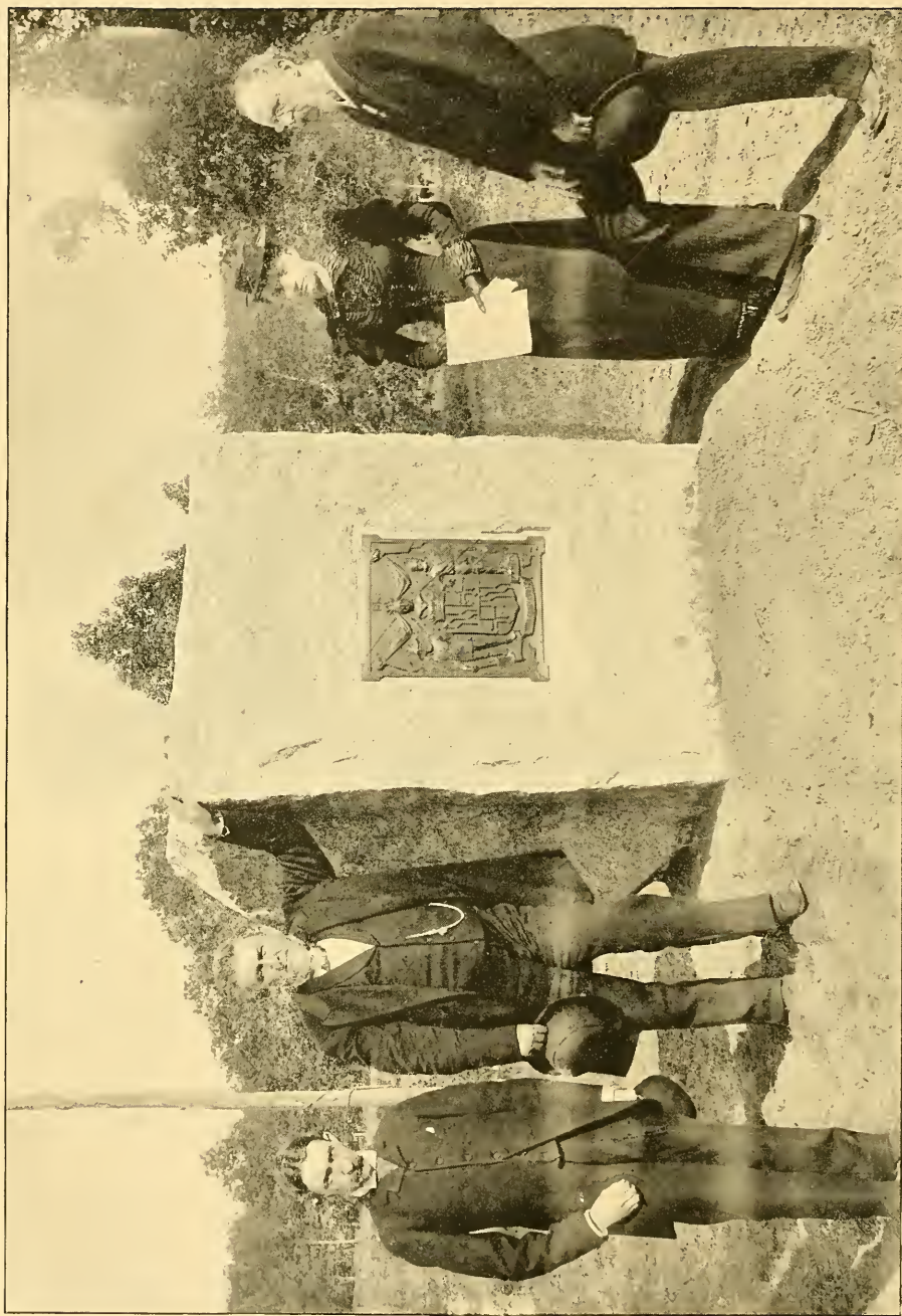
MONUMENT TO THE MARYLAND LINE ON GUILFORD BATTLE-FIELD,